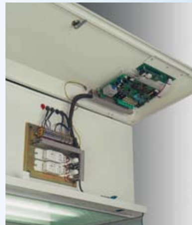
Easy access to electronic control board