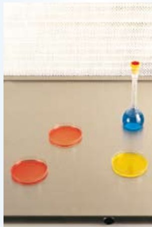
Working bench in stainless steel, easy to clean